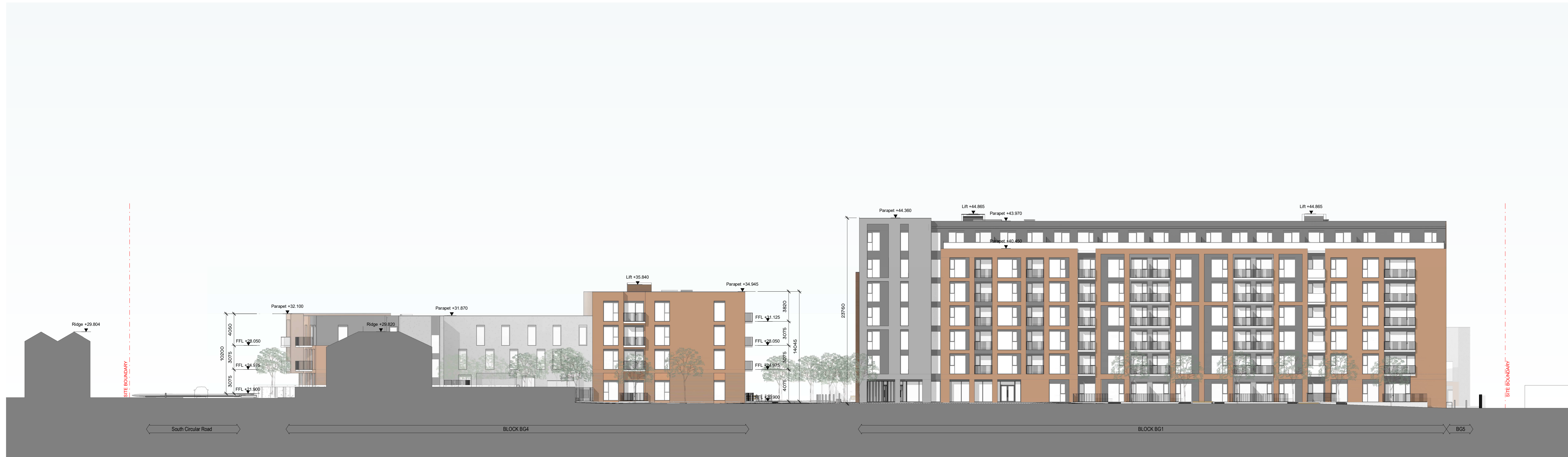
1 Contiguous Elevation 01 BG4-BG1 1 : 200