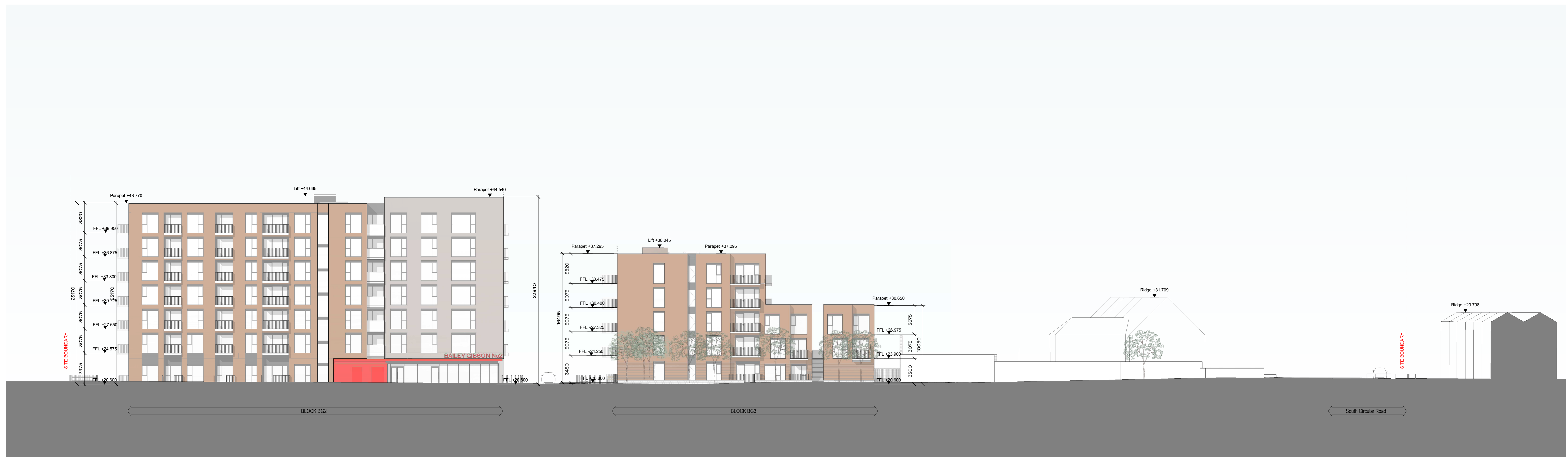
2 Contiguous Elevation 02 BG2-BG3 1 : 200